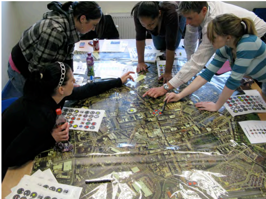
Fig. 1. Locals and experts working together in the Cultural Mapping Project to design their future neighbourhood, 2008-2010 University of Central Lancashire UK.

The following aspects proved to be essential components in the process of active citizen participation, collaboration and co-creation: