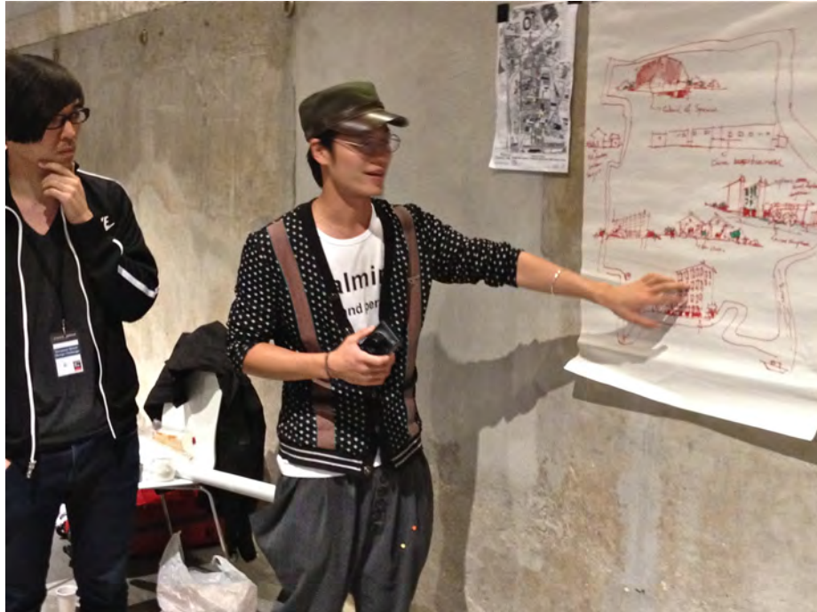
Fig. 3. The Chinese conceptual contribution to the innovative redesign of Saint Denis La Plaine at the 2012 European Street Design Challenge in Paris.