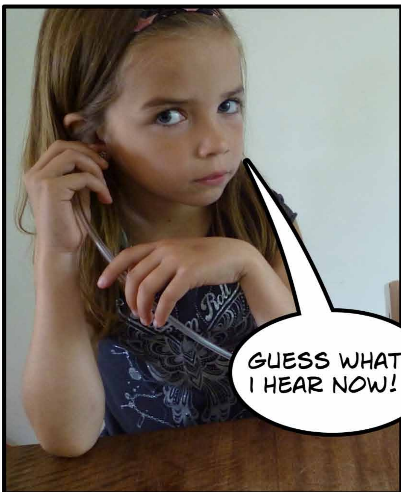
STORYBOX CONSISTS OF TANGIBLE, TECHNOLOGICALLY ENHANCED OBJECTS THAT FACILITATE LEARNING BY PLAYING.