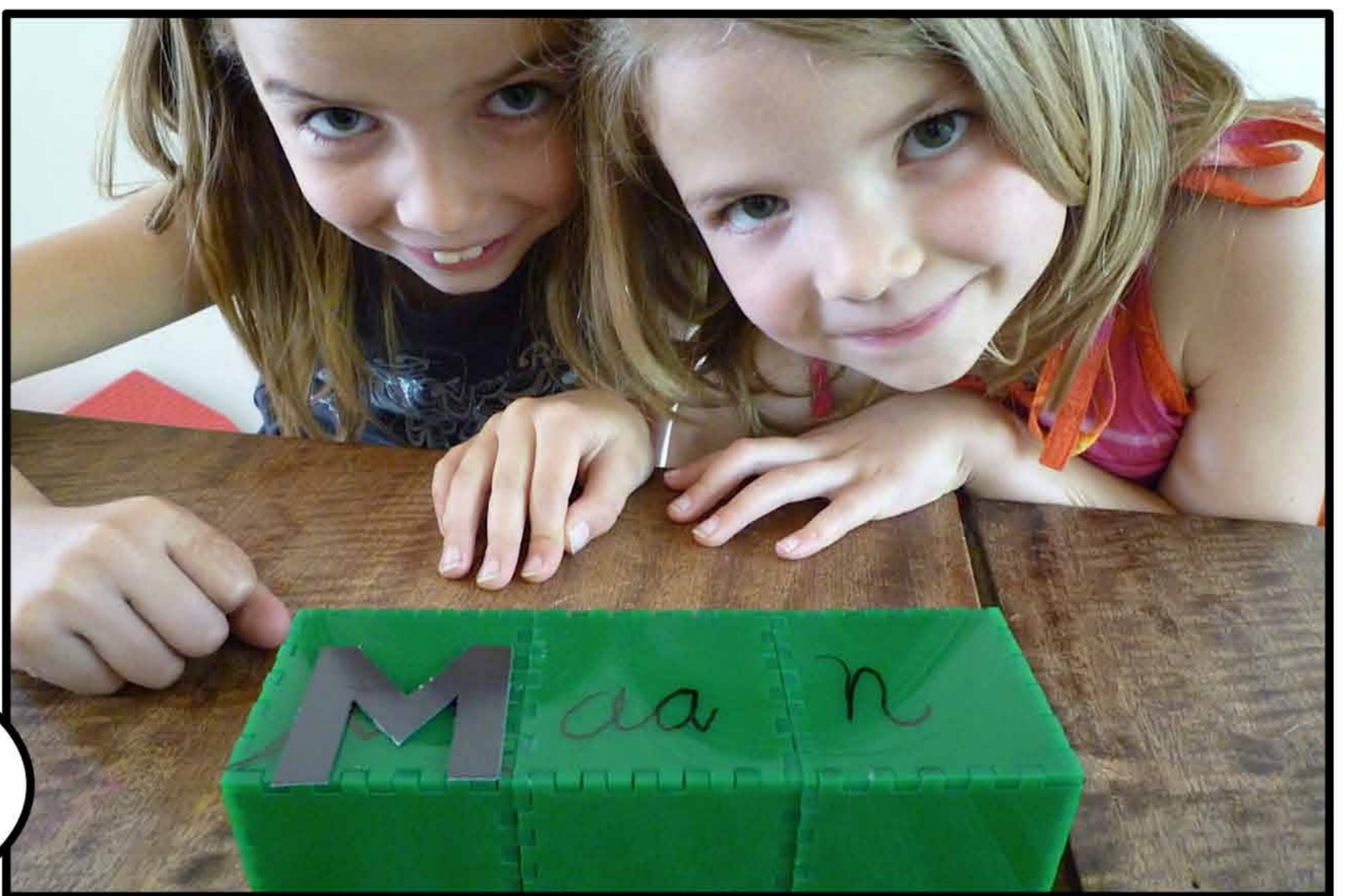
GAMING ENVIRONMENTS PROVIDE AN EXCITING PLACE TO EXPLORE THE WORLD!

More information at waag.org/storybox-gate